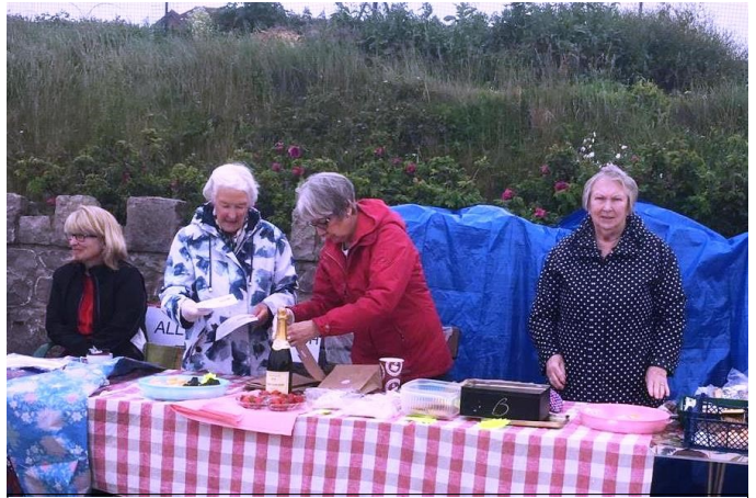
Pictured above: A bit cold and damp, but the All Saints' helpers at Deganwy Prom Day persevered and managed to sell nearly all their goodies.

All purchases were put into small paper carrier bags with an All Saints' sticker and containing a flyer giving details of our church services. On the back was an invitation to give an e-mail address, which was entry into a free raffle. These addresses can now be added to our mailing list for forthcoming church functions.