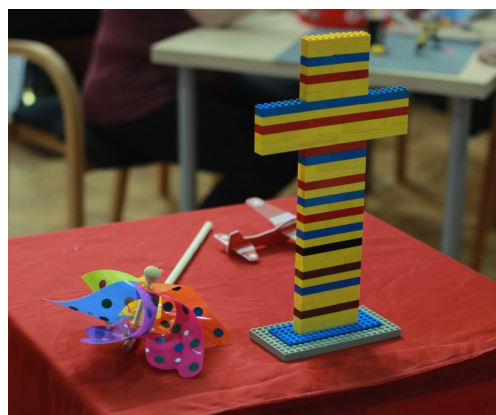
Pictured left: The Lego Cross - almost a permanent fixture at the back of St Paul's. (See more about the Lego activities on page 4).

All Saints, Deganwy • St Cystennin's, Mochdre • St David's, Penrhyn Bay St Doged's, Llanddaged • St Ffraid's, Glan Conwy • St Grwst's, Llanrwst St Hilary's, Llanrhos • St Katherine's, Bryn Pydew • St Martin's, Eglwysbach St Michael's, Llandudno Junction • St Paul's, Craig-y-Don